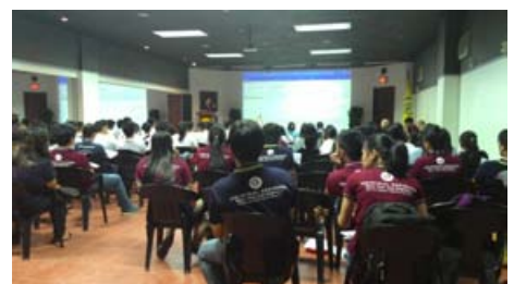
ORSP's commitment to provide continuing education of its members through Technical Forums and Workshops.