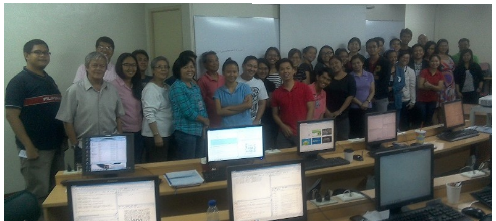
Participants and facilitators pose at “graduation” time, hoping to make good use of lessons learned.