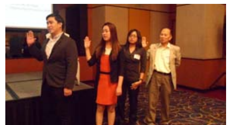
New members take their oath.