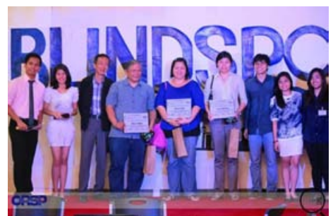
ORSP Judges given their certificates of appreciation by the organizers.