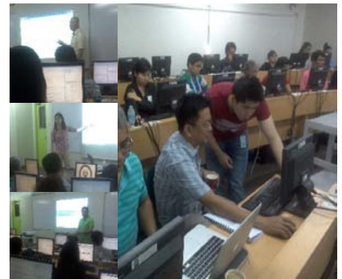
Tutors patiently teach and guide the R newbies.