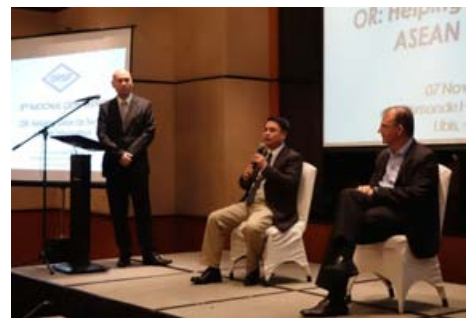
The annual conference is an opportunity for members to link up, share with and learn from each other.

2016 promises to be another activity-packed year for ORSP. Watch out for announcements at the ORSP website, http://orsp.org.ph .