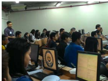
Combined lectures and hands-on exercises helped facilitate learning.

The audience came from the academe, business and the government sectors, specifically: Adamson University, Asia Pacific College, Camiguin Polytechnic State College, De La Salle University-Dasmariñas, De La Salle University – Manila, Holy Angel University, Lyceum of the Philippines University, PHINMA, Araullo University, University of Sto. Tomas, San Miguel Corporation, Nielsen, and National Anti-Poverty Commission. ♦