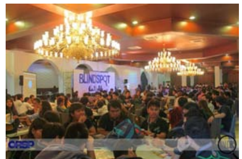
ORSP continued to fully support future OR workers through its continuing assistance in student congresses.